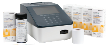
McKesson Consult™ Urinalysis