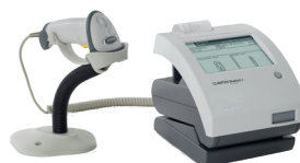
Siemens CLINITEK Status®+