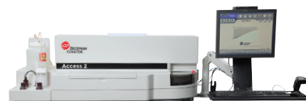
Beckman Coulter Access® 2*