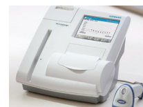
Siemens DCA® Vantage