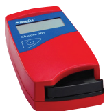
HemoCue® Glucose 201