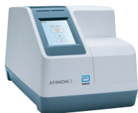
Abbott Afinion 2™