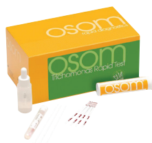
OSOM® Trichomonas Rapid Test