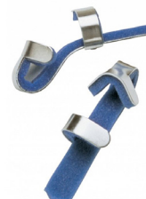
Orthopedics, splints and supports