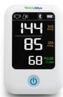
Patient assessment and monitoring