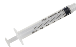
Needles, syringes and sharps containers