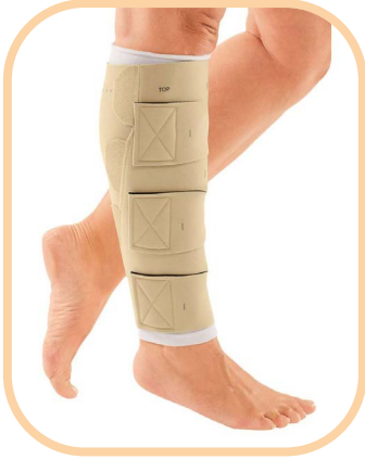
circaid® Reduction Kit Regular/Standard, Beige, Lower Leg #1228583