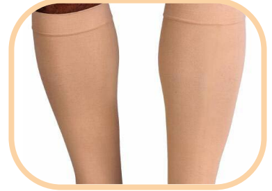
JOBST® Relief® Compression Stocking Knee High, Large, Beige, Closed Toe #423054