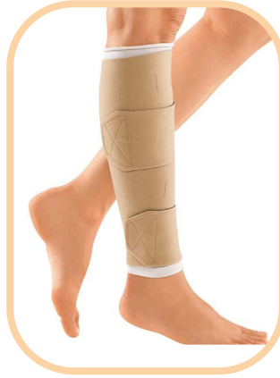
circaid® juxtalite® Compression Wrap Large/Long, Tan, Lower Leg #1163723