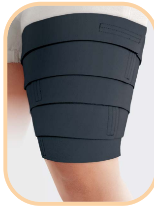
ReadyWrap™ Compression Wrap Large/Average, Black, Thigh #1196755