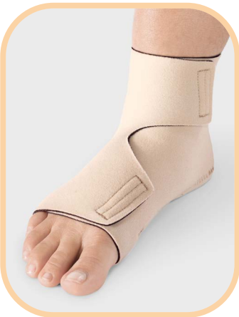
ReadyWrap™ Compression Wrap Large, Beige, Right Foot #1106840